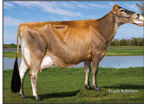
KY-HI TOPEKA HOPEFULL-P-ET, E-90% SISTER TO THE DAM OF LOT 102