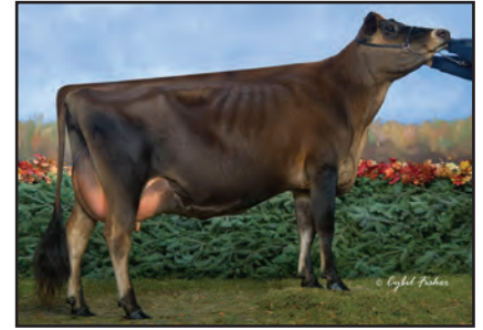
TIERNEYS JADE LETA {6} Great-Grandam of Lot 27

SISTER(S): TIERNEYS DUAISEOIR LETTY 86% 5-02 305 2 16410 4.3 709 3.7 608 95DCR 1979C TIERNEYS VINDICATION LOLITA 85% 3-03 192 2 10750 4.6 492 3.6 382 85DCR 1316C