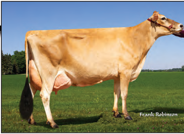
KY-HI GALVANIZE MALIA, E-90% Grandam of Lot 7