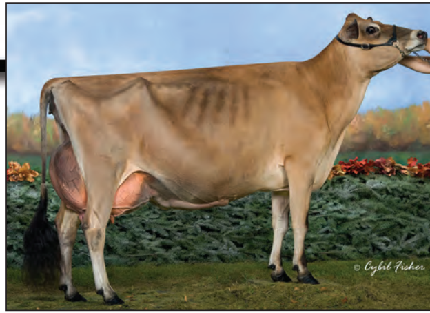
STORA OF OBLONG VALLEY, E-94% Great-Grandam of Lot 12