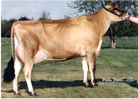
DREAMROAD REMAKE KEEPGEUSS, E-90% FIFTH DAM OF LOT 116D