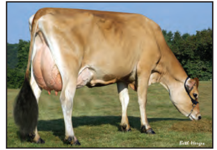
DUTCH HOLLOW VALENTINO CHERYL-ET Grandam of Lot 33