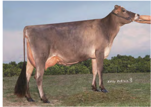
FVF CANYON MATLIDA, E-93% FROM THE SAME FAMILY AS LOT 113C