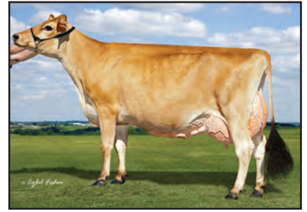
DUTCH HOLLOW NEWS CHERI-ET Sister to Lot 33