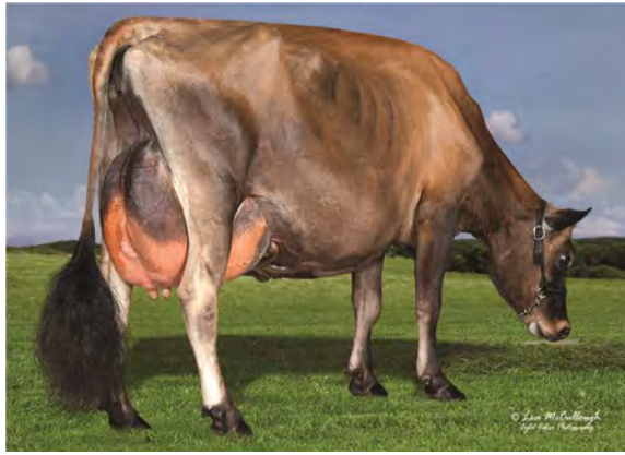
SAMPLE FARM IMPULS HARMONY {4}, E-93% SISTER TO THE GRANDAM OF LOT 106