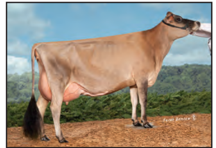
COWBELL SOCRATES MADEMOISELLE Grandam of Lot 17

SISTER(S): COWBELL IMPRESSION MIAMI-ET 90% 4-01 288 2 19850 4.2 843 3.4 680 97DCR 2290C JUNIOR CHAMPION, 2016 NEW YORK STATE FAIR RESERVE JUNIOR CHAMPION, 2016 EASTERN STATES EXPO COWBELL ANDREAS MEMPHIS-ET 89% 2-06 305 2 16670 4.1 690 3.5 587 97DCR 1917C COWBELL ANDREAS MANHATTAN-ET 86% 2-00 252 2 9960 4.3 425 3.6 361 94DCR 1181C COWBELL IMPRESSION MALIBU-ET 84% 1-10 305 2 14280 4.3 614 3.5 494 97DCR 1666C 1ST SENIOR YEARLING, 2019 NEW YORK STATE FAIR 1ST SENIOR YEARLING, 2019 NY STATE FAIR JUNIOR SHOW COWBELL ANDREAS MOROCCO-ET 83% 3RD WINTER YEARLING, 2019 EASTERN STATES OPEN & JR