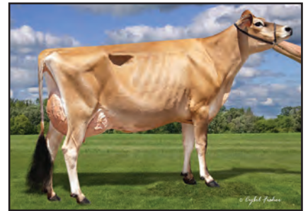
KEVETTA CHROME VIOLIN-ET, VG-89% Sister to Lot 9