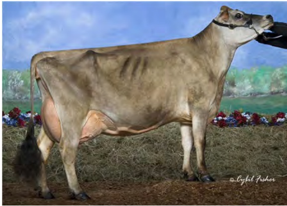
UNDERGROUND MAMIES SPARK, E-91% FOURTH DAM OF LOT 104