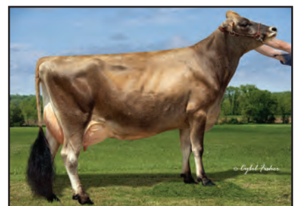
DUTCH HOLLOW SAMSON CHERISH 5254-ET Sister to the Grandam of Lot 33