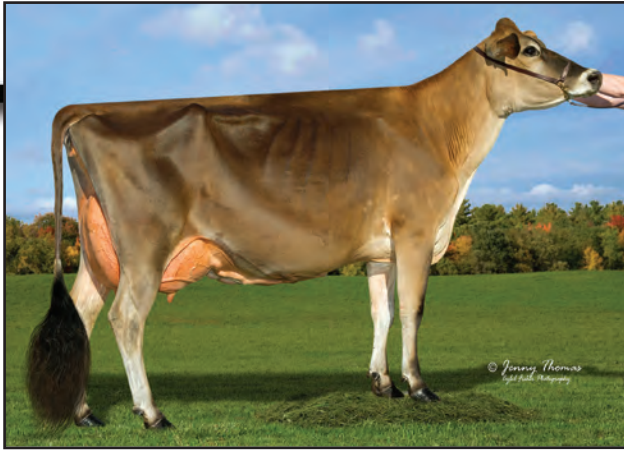
TIERNEYS INCENTIVE LUAU, E-92% Sister to the Gandam of Lot 25