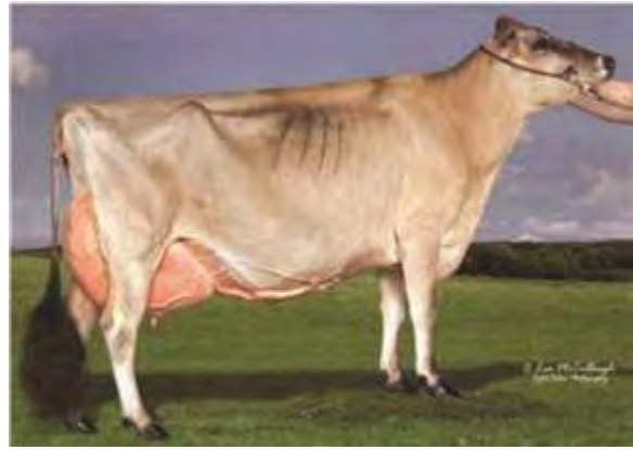
DREAMROAD SULTAN KEEPTRYING, E-94% GREAT-GRANDAM OF LOT 116D