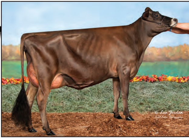
COWBELL SHOES MOMMA MIA, VG-88% 3rd Milking Yearling, 2020 All American Junior Show From the Same Family as Lot 17