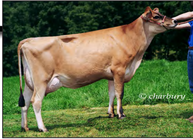
SBF ACTION VALENTINE, E-91% Fourth Dam of Lot 8