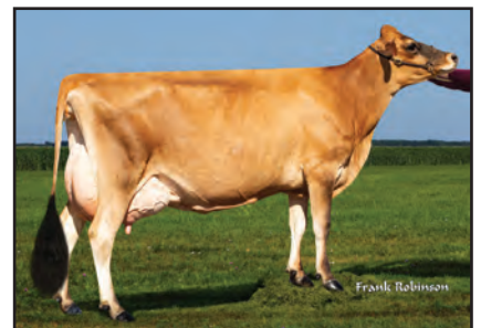
KY-HI OLIVER JOYFULL-P-ET, E-90% From the Same Family as Lot 7