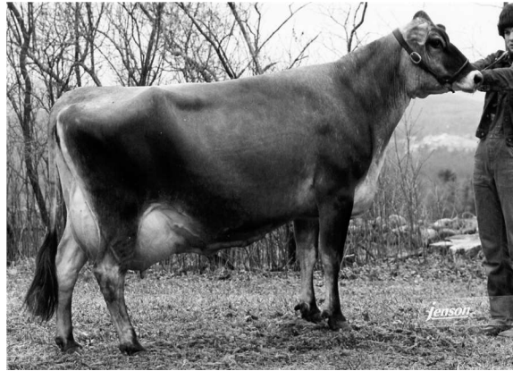
HIGHLAND GENERATOR O DELORES, E-90% DAM OF HIGHLAND MAGIC DUNCAN EIGHTH DAM OF LOT 111C