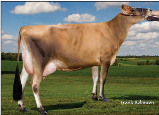
KY-HI TOPEKA FAITHFULL-ET, E-93% SISTER TO THE DAM OF LOT 102