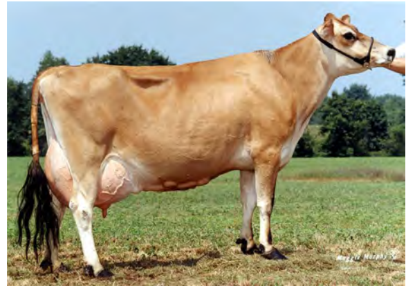
PRICELAND BERRETTA TERRIFIC-ET, E-90% SIXTH DAM OF LOT 114C