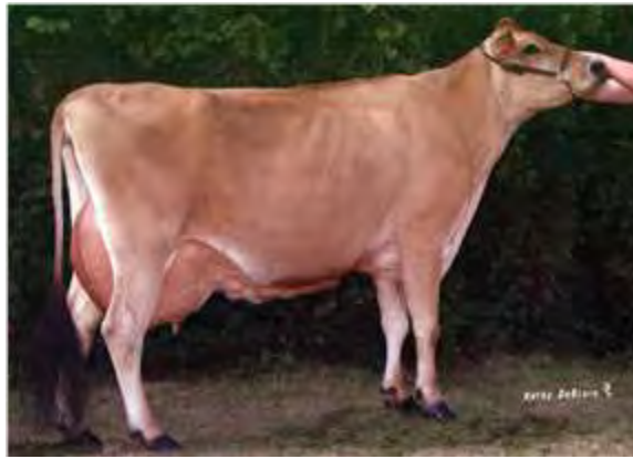
DREAMROAD VIKING SPUNKY, E-94% SIXTH DAM OF LOT 115A