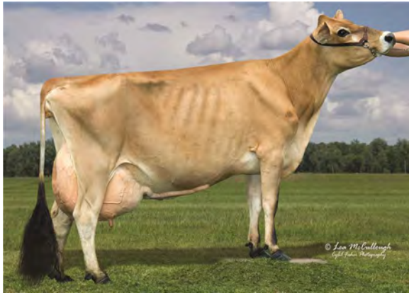
BK/DK MATINEE TASKET, VG-87% FOURTH DAM OF LOT 114C