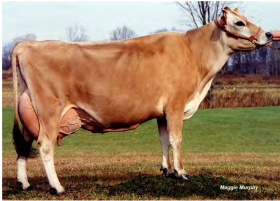
FRIENDLY VALLEY DC MEL, E-95% SIXTH DAM OF LOT 114E