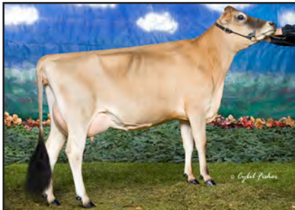
UNDERGROUND MAMIES II-ET Sister to the Grandam of Lot 10