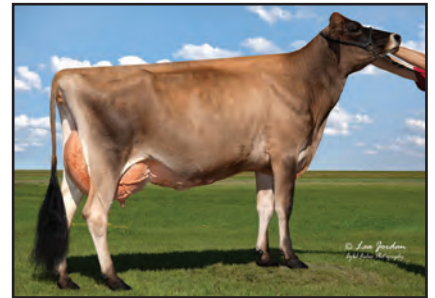
KEVETTA APPLEJACK VEGAS Sister to Lot 9