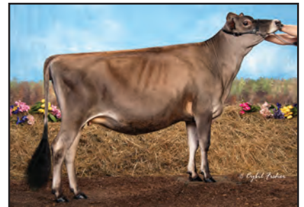
COWBELL REQUEST MICKAYLA Great-Grandam of Lot 17