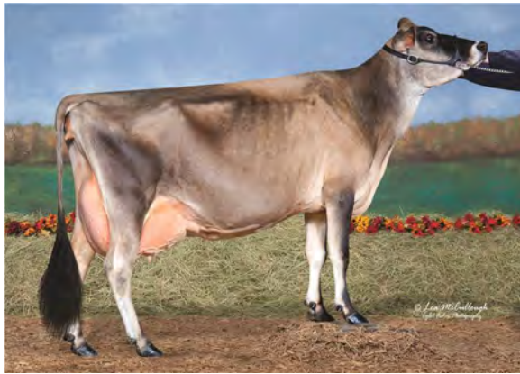
DREAMROAD ZBW IATOLA CRACKER-ET, E-94% GREAT-GRANDAM OF LOT 115E