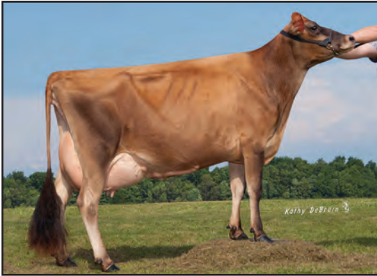
HAVS LOVABULL WATCHFULL-P, E-93% GRANDAM OF LOT 102