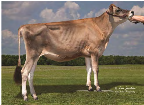
HOLTMART VALENTINO HONEST DAM OF LOT 118