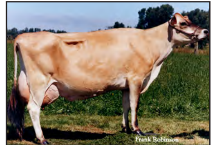
GOLDUST SOONER LEA (6), E-93% Sixth Dam of Lot 11