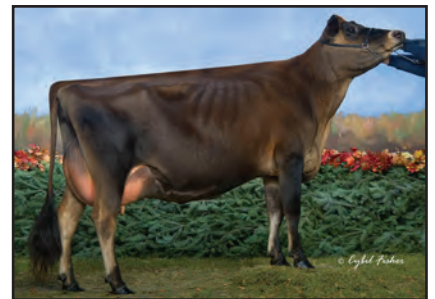
TIERNEYS JADE LETA {6}, E-91% From the Same Family as Lot 25