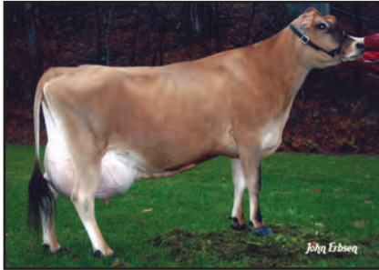
LAWTON BARBER FARCI Fourth Dam of Lot 28