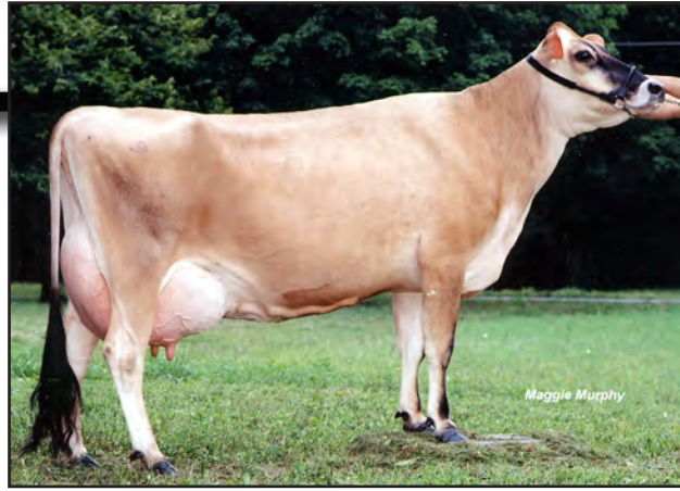
LAWTONS BERRETTA SONG, E-90% Fourth Dam of Lot 16