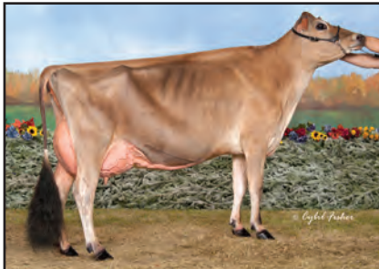
STORAS SULTAN SULTRY Sister to the Grandam of Lot 12