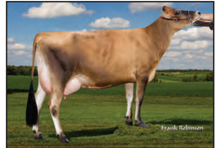
KY-HI TOPEKA FAITHFULL-ET, E-93% From the Same Family as Lot 7