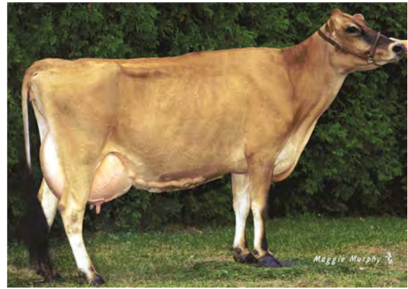
FRIENDLY VALLEY BRITTA STARBRIGHT, E-92% SIXTH DAM OF LOT 113D