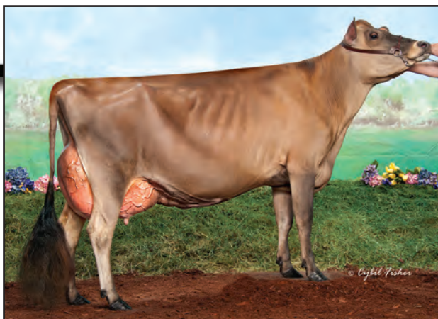
UVM-CREAM HIREDGUN STARDUST, E-90% Great-Grandam of Lot 20