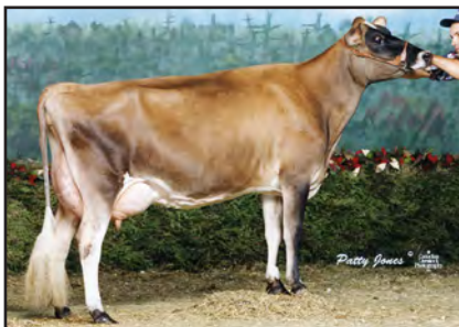
ENNSKILLEN MCT MAMIE, EX (CAN) Fifth Dam of Lot 10