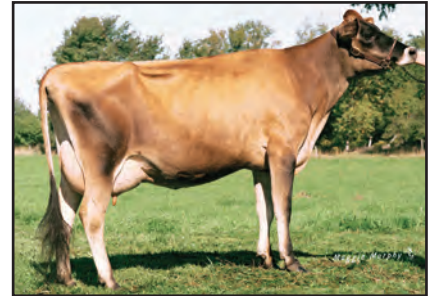
TIERNEYS LONILU JUNO {3}, E-93% Seventh Dam of Lot 25