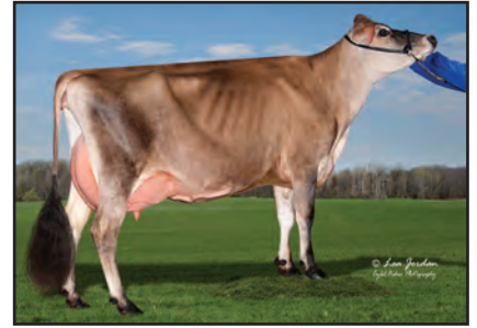
KEVETTA CITATION A VERNA-ET Sister to Lot 9