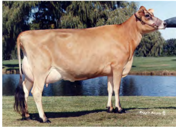
COWBELL IMPERIAL NESTLE, E-93% FIFTH DAM OF LOT 115D