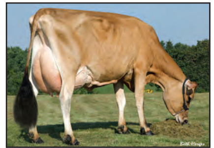
DUTCH HOLLOW VALENTINO CHERI-ET Sister to the Grandam of Lot 33