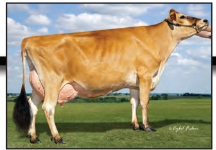
DUTCH HOLLOW MACK CHERYL 6015-ET Dam of Lot 33

4TH DAM: DUTCH HOLLOW MONTANA CHERY 85% 1-08 305 2 21650 4.3 923 3.2 701 100DCR 2420C