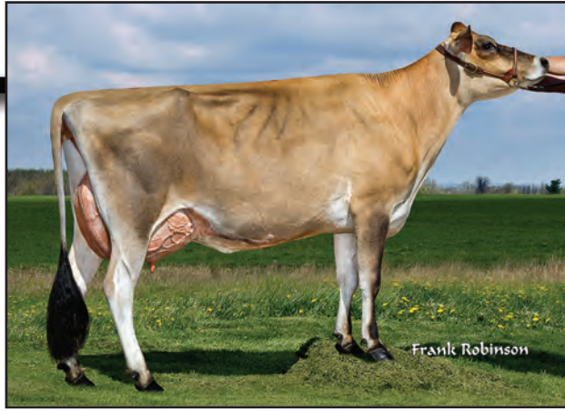
POSIE PAT OF SPRINGDALE, E-90% Great-Grandam of Lot 2