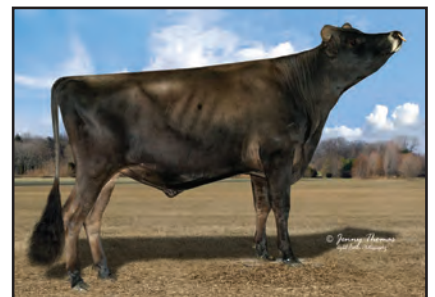
COWBELL BLUE SUEDE SHOES Sire of the Dam of Lot 17