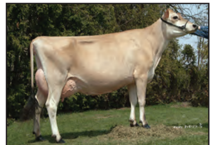
TIERNEYS JUDE LETICIA {5}, E-94% From the Same Family as Lot 25