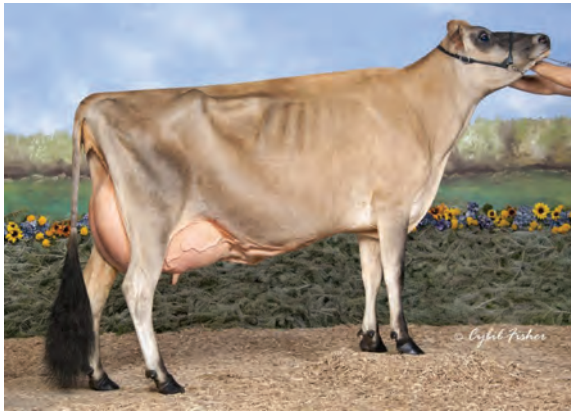
LEW-LIN VALOR KOOKY-P, E-95% DAM OF LOT 100