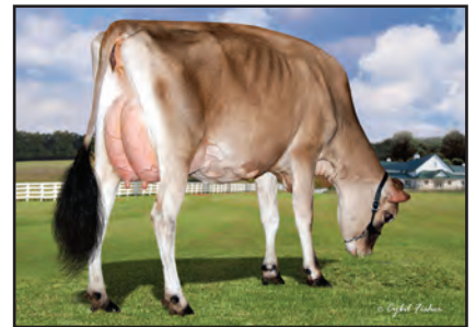
GOLDUST KARBALA LAINA-ET Grandam of Lot 11