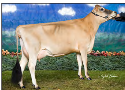
TIERNEYS IMPRESSION TURTLE DOVE, VG-87% From the Same Family as Lot 36