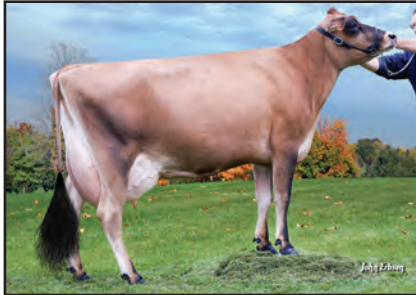
LAWTONS AVIATOR FEATHER Sister to the Grandam of Lot 28