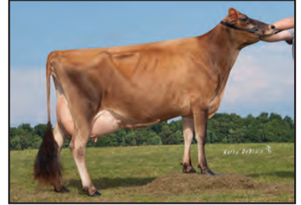
HAVS LOVABULL WATCHFULL-P Fourth Dam of Lot 7

4TH DAM: HAVS LOVABULL WATCHFULL-P 93% 7-08 305 3 23470 4.9 1143 3.4 797 102DCR 2753C GRAND & SENIOR CHAMPION, 2010 DELAWARE COUNTY (NY) PARISH SHOW 1ST JR 3-YEAR-OLD, 2010 DELAWARE COUNTY (NY) JERSEY PARISH SHOW 1ST 4-YEAR-OLD, 2011 NY STATE FAIR JR SHOW 3RD 5 & 6-YEAR-OLD, 2013 DELAWARE COUNTY (NY) JERSEY PARISH SHOW 6TH AGED COW, 2013 NY STATE FAIR YD PROTEIN WINNER 4-YR-OLD, 2013 ALL AMERICAN JR SHOW