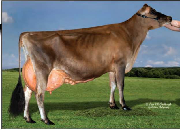
LAWTONS BLACKSTONE FROSTY, E-93% Grandam of Lot 28