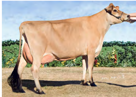
LEW-LIN REMAKE KINKY-P, E-93% GRANDAM OF LOT 100