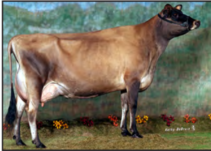
CROOKER BROOK TRADS SPENCER Fourth Dam of Lot 12