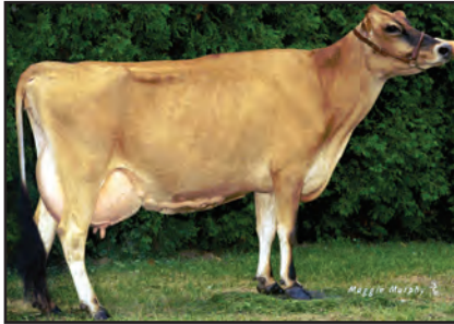
FRIENDLY VALLEY BRTTA STARBRIGHT, E-92% Sixth Dam of Lot 30