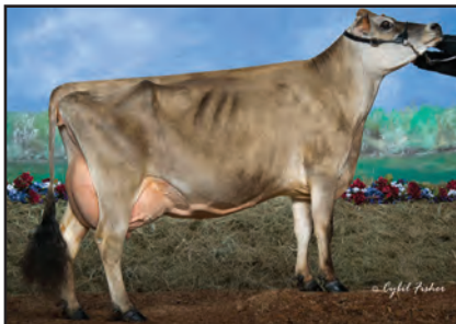
UNDERGROUND MAMIES SPARK-ET Sister to the Grandam of Lot 10