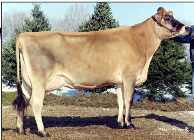
SSF CENTURION ANDIE, E-91% Great-Grandam of Lot 14