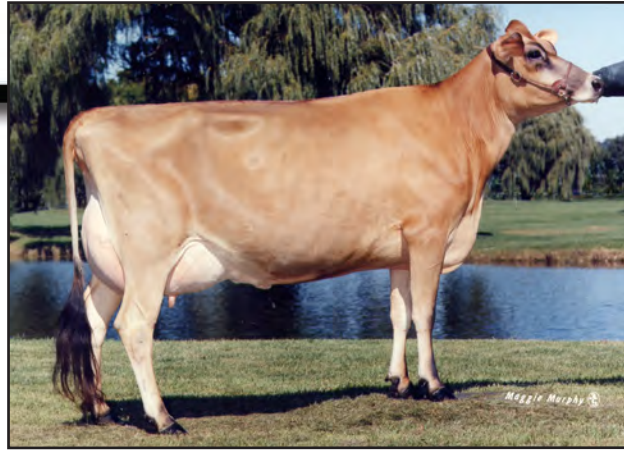
COWBELL IMPREIAL NESTLE, E-93% Fifth Dam of Lot 18