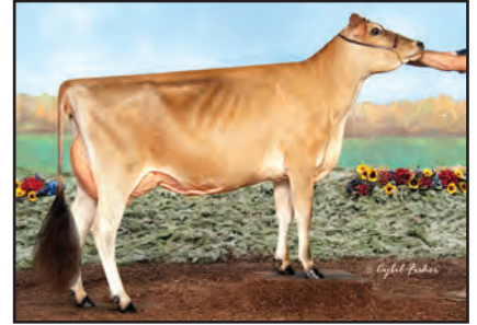
RIVER VALLEY CITATION LOVELY-ET Dam of Lot 11

SISTER(S): GOLDUST GERONIMO LEANNA-ET 92% 4-09 305 2 41950 4.9 2041 3.7 1554 102DCR 5376C JX GOLDUST GARDEN LEANNA {3}-ET 90% 2-10 305 2 29770 5.4 1598 3.6 1063 102DCR 3675C JX GOLDUST DALE LEANNA {3}-ET 87% 3-11 305 2 34120 5.8 1968 3.8 1291 102DCR 4467C GOLDUST MERCHANT LYMARI-ET 88% 3-04 305 2 31070 5.0 1552 3.6 1129 102DCR 3904C GOLDUST RENEGADE LYMARI-ET 85% 1-09 302 2 21440 5.8 1235 3.7 799 101DCR 2764C GOLDUST KARBALA LAE-ET 84% 4-00 305 2 32950 4.9 1616 3.8 1254 102DCR 4326C PINE-TREE ZIPPER LEANNA-ET 83% 3-01 305 3 20160 5.2 1039 3.9 787 104DCR 2724C PINE-TREE MAGNUM LISA-ET 86% 3-02 305 3 20500 5.5 1118 3.8 781 104DCR 2702C PINE-TREE MAGNUM LUCY-ET 81% 5-00 302 3 25560 5.3 1353 3.9 1004 104DCR 3476C JX PINE-TREE GOLDA LUCIA {4}-ET 90% 4-11 305 2 23900 5.0 1206 3.6 856 98DCR 2959C PINE-TREE LEANNA APPLECRISP-ET 90% 3-06 294 2 19550 5.5 1076 4.0 787 96DCR 2725C PINE-TREE SPARKY LYNN-ET 90% 3-06 305 2 19420 5.1 998 3.7 722 97DCR 2497C PINE-TREE CITATION LEANNA-ET 90% 2-10 305 3 21620 5.9 1271 4.1 895 104DCR 3100C PINE-TREE SPARKY LICORICE-ET 90% 3-02 305 3 22380 5.3 1182 3.7 834 97DCR 2885C PINE-TREE SPARKY LEORA-ET 85% 2-10 305 3 22330 5.5 1217 3.7 834 104DCR 2885C