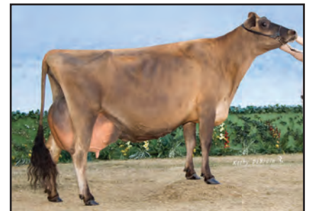
TIERNEYS REN LINDA LOU {4}, E-95% Fifth Dam of Lot 27