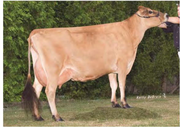
FVF STARBURST MELANIE, E-92% FROM THE SAME FAMILY AS LOT 113B