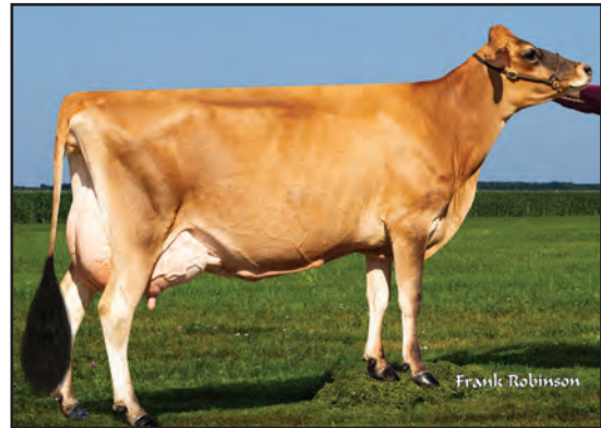
KY-HI OLIVER JOYFULL-P-ET, E-90% SISTER TO THE DAM OF LOT 102