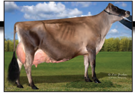
OAKFIELD TBONE VIVIANNE-ET Dam of Lot 9

GENESIS RENAISSANCE VIVIANNE VG 87 (CAN) 5-00 303 2 12110 4.2 514 3.8 461 CAN 1464C