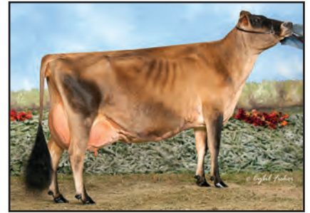
HURONIA CENTURION VERONICA 20J Great-Grandam of Lot 9