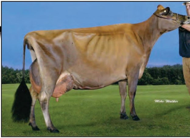
TIERNEYS TEQUILA LADA, E-95% Grandam of Lot 27