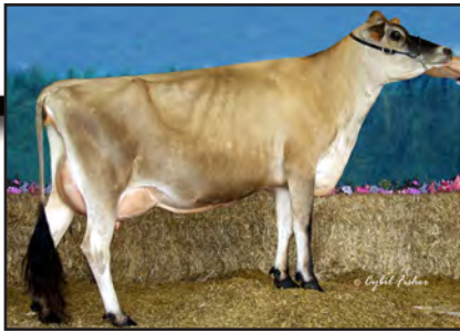
MID-DEL NATE MAMIE Grandam of Lot 10