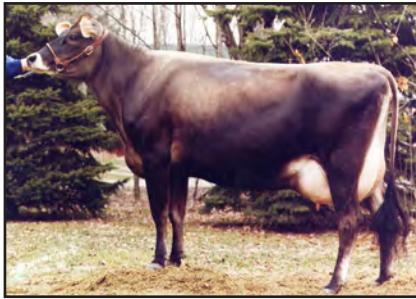
LAWTONS DUNCAN SERANADE, VG-88% Fifth Dam of Lot 16