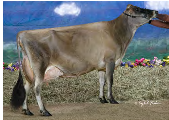
DREAMROAD GOLDEN CRACKLE, E-94% FOURTH DAM OF LOT 115E