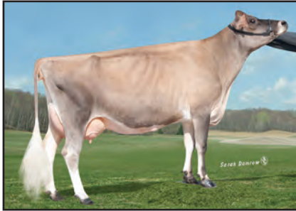
UNDERGROUND PT N-MAMIE-ET Sister to the Dam of Lot 10