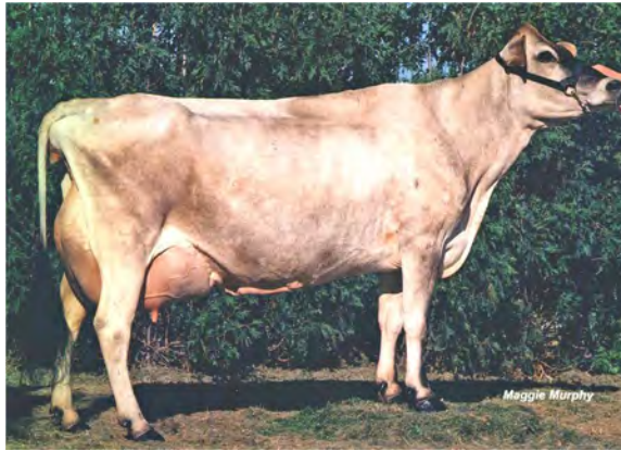
DREAMROAD LESTER CARLY, E-95% SEVENTH DAM OF LOT 116E