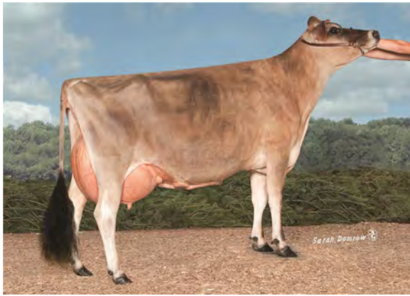
FVF MILITIA STARWISH, E-94% GRANDAM OF LOT 113D