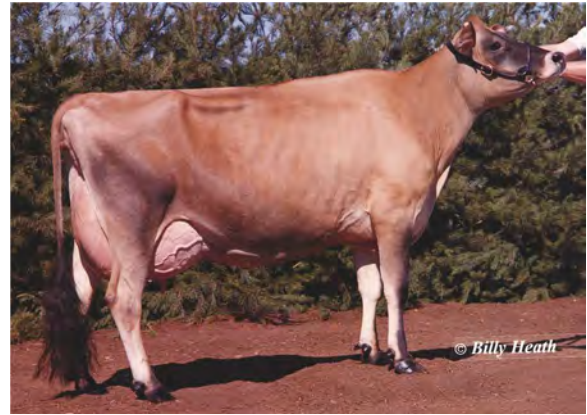
ENNISKILLEN REN MAMIE, E-93% SIXTH DAM OF LOT 104