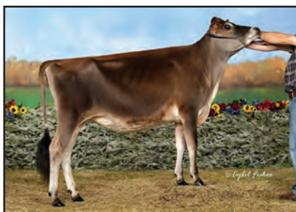
TIERNEYS HIRED GUN TEAGAN, E-91% From the Same Family as Lot 36

BORN 03/30/2020 PO FEMALE EFI 6.8% AMERICAN ID 1927/1927