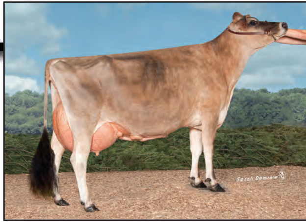
VFV MILITIA STARWISH, E-94% Grandam of Lot 30