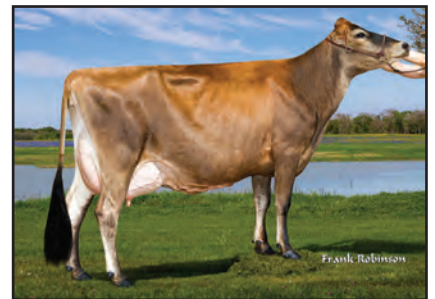
KY-HI TOPEKA HOPEFULL-P-ET, E-90% From the Same Family as Lot 7