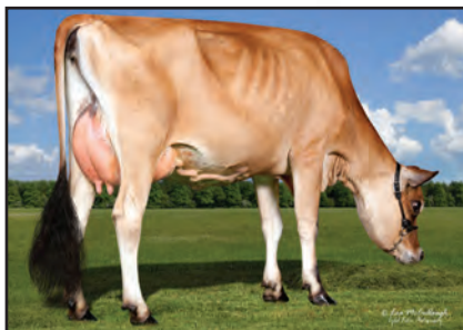
TIERNEYS HIRED GUN TAMALE, VG-86% From the Same Family as Lot 36